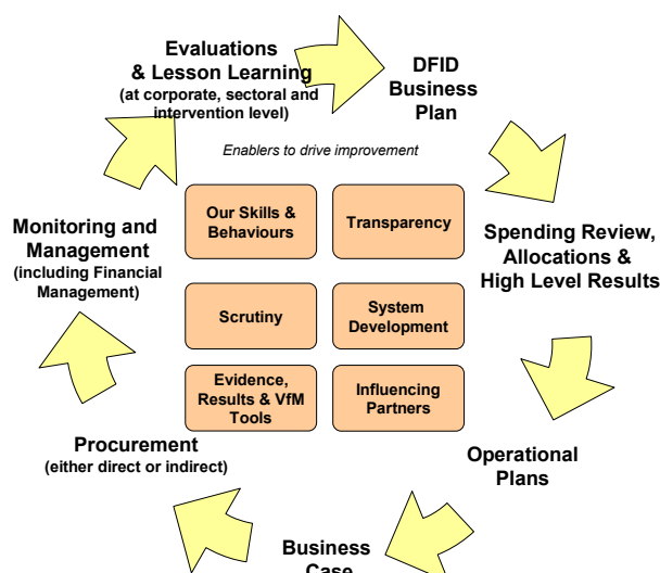
Figure 2: DFID Results & VfM Framework

The Investment Committee doesn't feature in the diagram but plays a key role in overseeing the whole VfM cycle and setting priorities for its improvement.